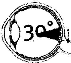
Conventional non-dilated exam

If not covered by insurance, The Optomap® retinal scan is provided for a fee of $30.00